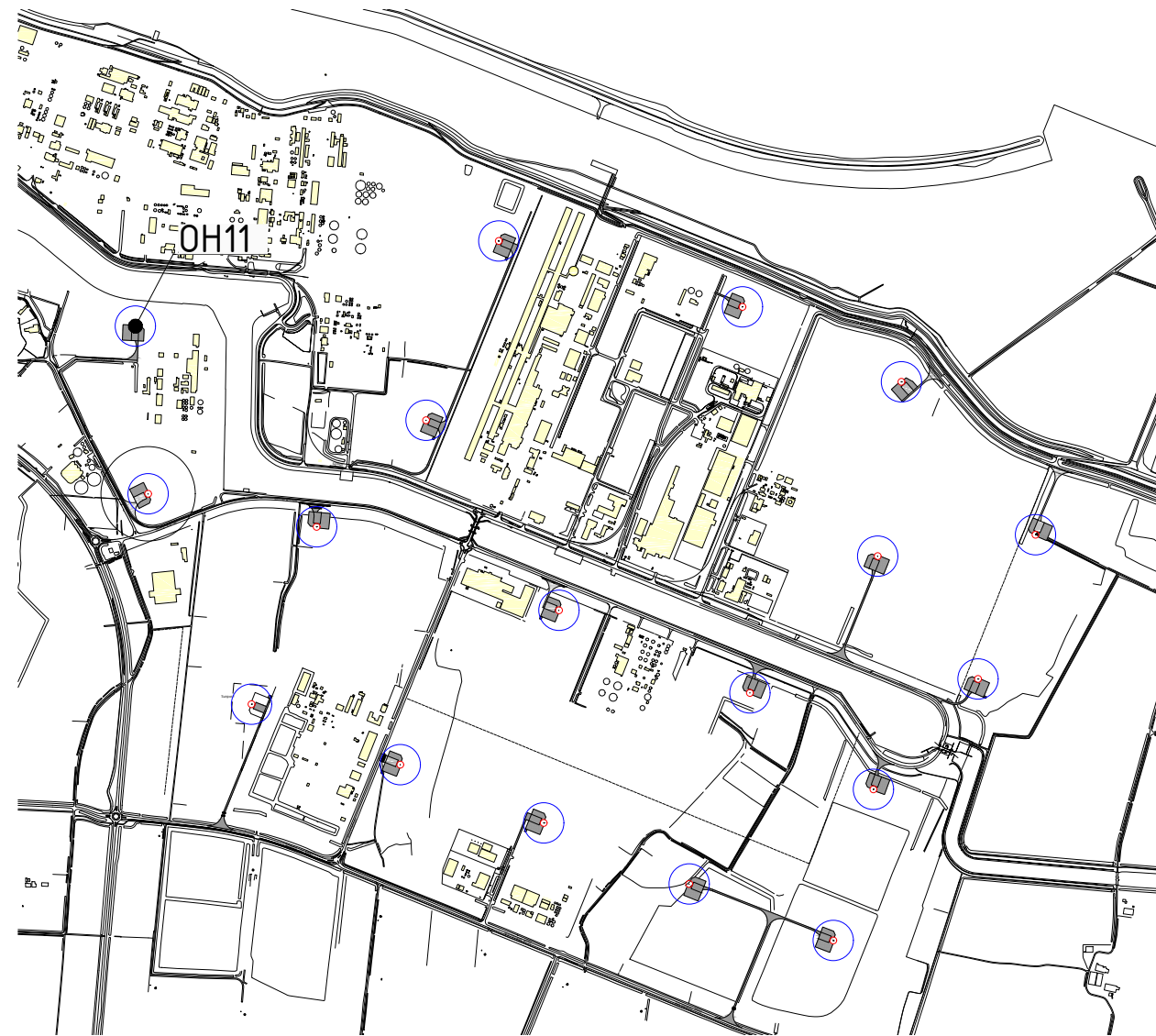
SITUATIE schaal 1:25.000